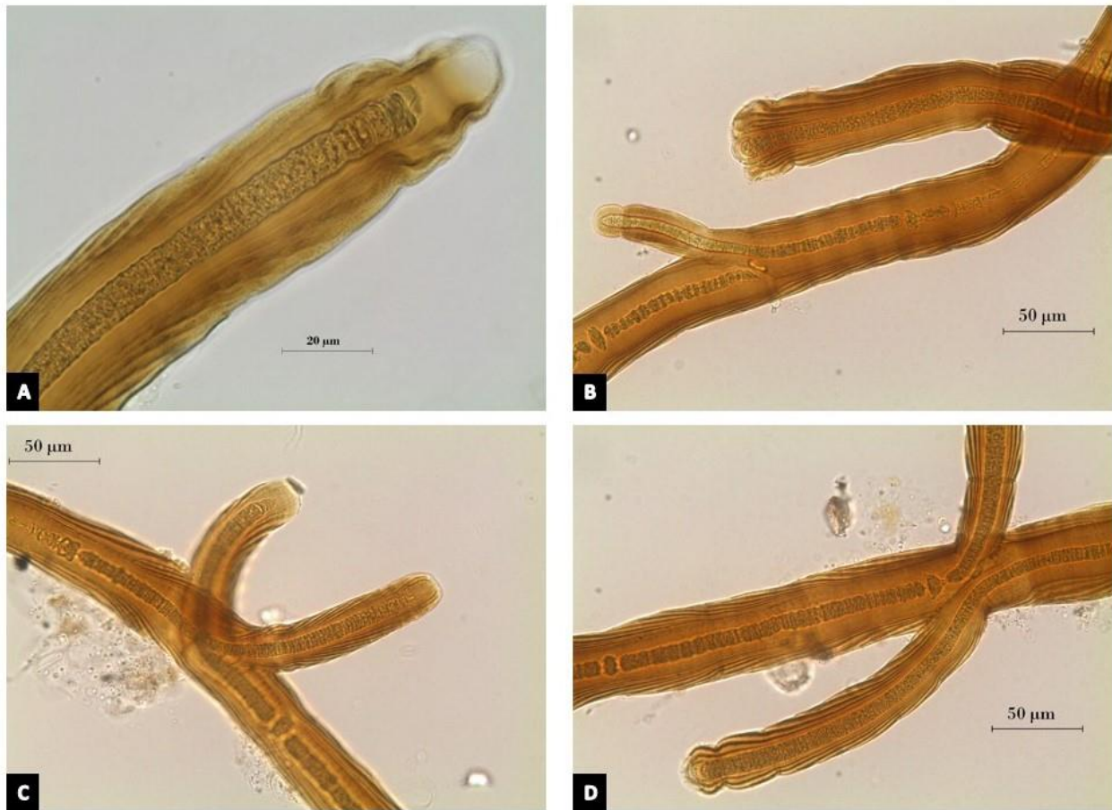
Fig. 3. P. densum : A. Apical end of filament B. Filament with single false branch C. Filament with geminate false branches D. Filament with several layers in yellowish brown sheath, with oblique lamellations, and trichome with heterocyte

were found more or less similar with the dimensions of P. alatum mentioned by Uher (2010). The worldwide distribution of P. alatum is given by Maree et al. (2018). A species of the genus Scytonema i.e. S. crassum was merged into the genus Petalonema by Migula (1907) as P. crassum . This species was collected from wet rocks under the trickling water at Bhandardara in Ahmednagar district. The morphological characters of this species were found similar to S. crassum as described in Desikachary (1959) and P. crassum as described in Komárek (2013). There are no previous records of this species from Maharashtra, and therefore considered as a new addition to this state. Migula (1907) also separated Scytonema densum from the genus Scytonema and merged into the genus Petalonema as P. densum . From the Maharashtra, the only past record on this species is by Kamat (1963) who described it from the moist soil at Takala, Kolhapur. The author has collected P. densum from calcareous rocks at Malvan which