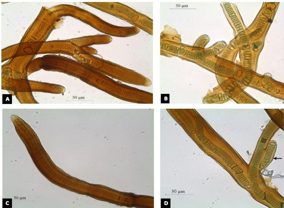
Fig. 2. P. crassum : A. Filament with yellow to brown broader sheath around the trichome B. Filament with single and geminate false branches showing blue green trichomes C. Filament with distinct divergent lamellations in the sheath D. Hormogone with terminal heterocytes (arrow).